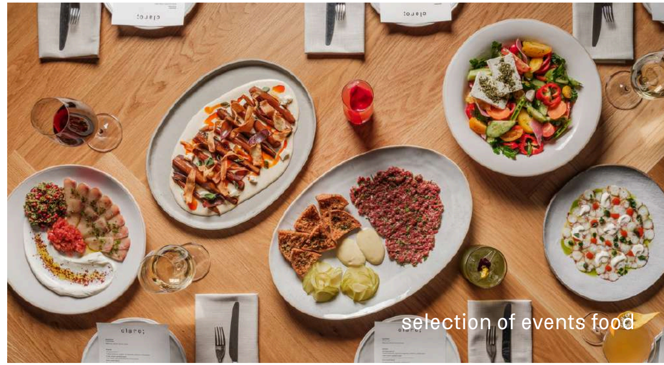
selection of events food