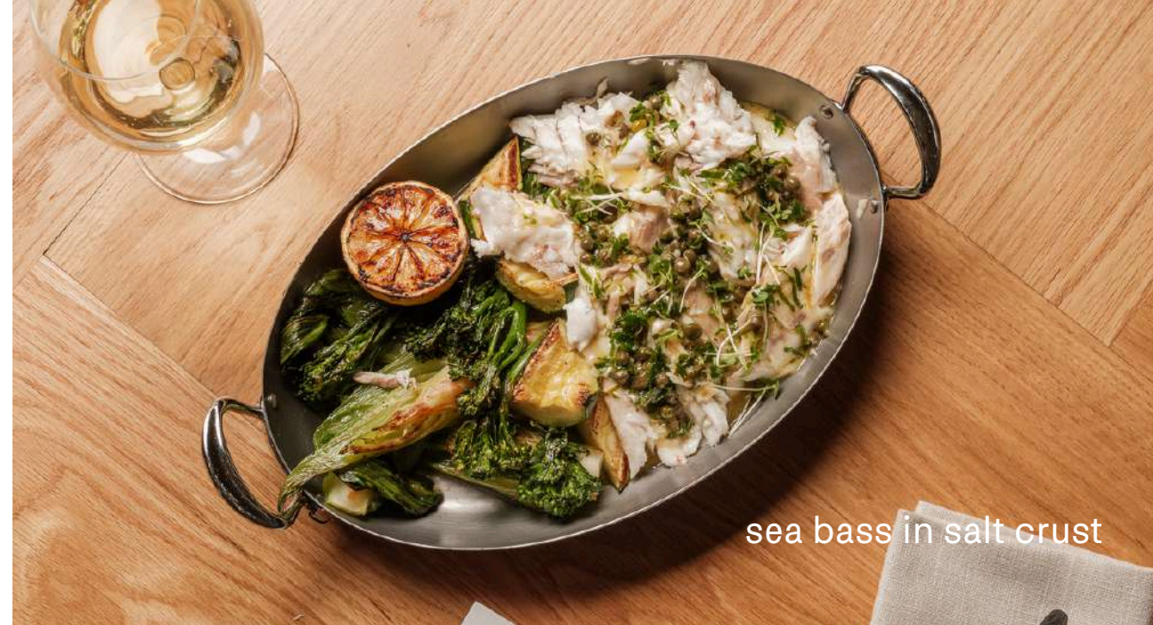
sea bass in salt crust